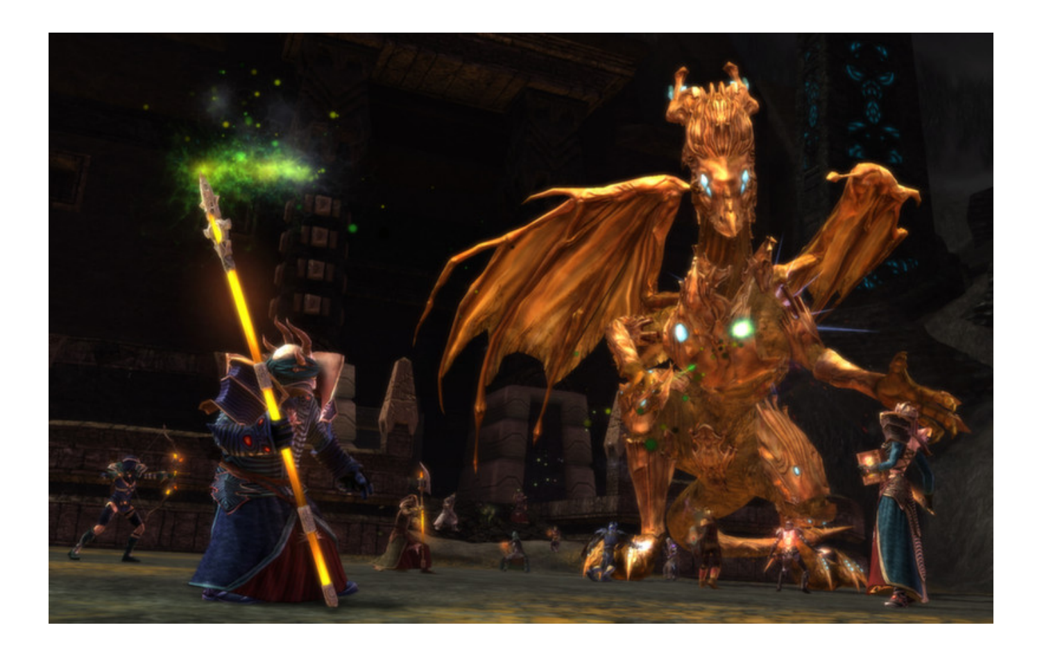
RIFT: Glory Of The Ascended Pack Ativador Download [Patch]